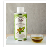
MURRAY'S CHEESE La Tourangelle Pistachio Oil