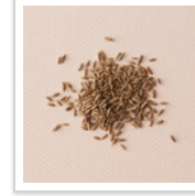
WHOLE SPICE Whole Cumin