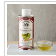
MURRAY'S CHEESE La Tourangelle Hazelnut Oil

Make squash seed sauce... or pumpkin coffee. Take the seeds and pulp from a pumpkin and put them in a medium saucepot with some sweet pie spices and enough water to cover. Simmer for 30 minutes, then cover and steep for an additional 30 minutes. Strain out the solids, leaving a dark orange liquid. This pumpkin seed stock can be reduced, seasoned with salt, and emulsified with cold butter to make a clean, pure-tasting sauce for fish or pasta. It can also be used as a steaming or poaching liquid for shellfish and vegetables. Finally, we've been known to bring it to a simmer and pour it over ground coffee in a French press to make a non-traditional but absolutely delicious version of pumpkin coffee.