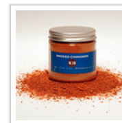
LA BOÎTE À ÉPICE Smoked Cinnamon