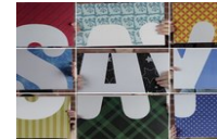
SAY: eCard 2011