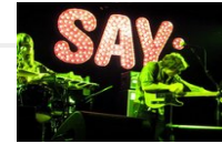
SAY: CES 2012 - Featuring Givers

© MMX SAY Media, Inc. Privacy Policy & Opt-Out Info