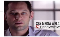
SAY: Welcomes ReadWriteWeb